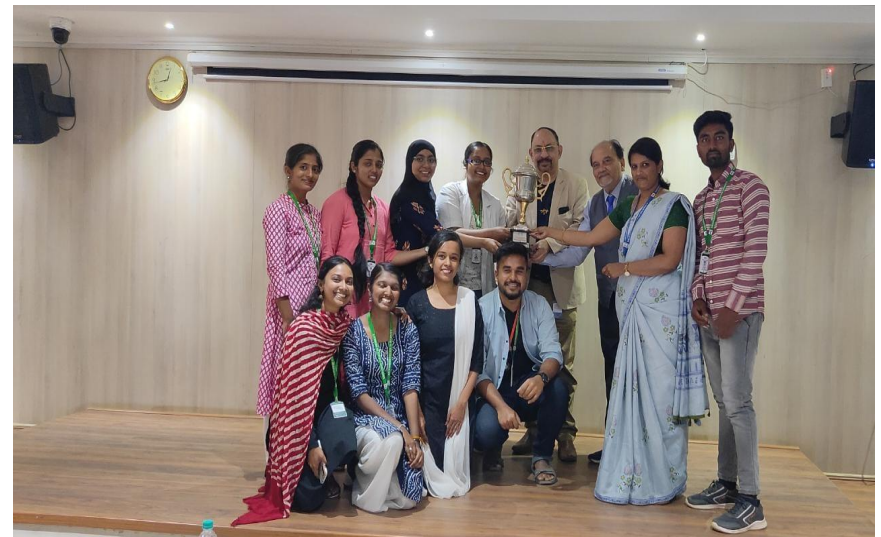
Overall championship trophy